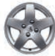
Monaco 15" Alloy Wheel*