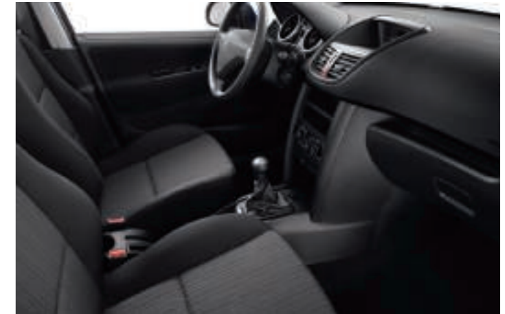
Savana cloth* – Available on Urban