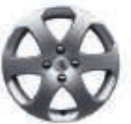
Outdoor 16" Alloy Wheel*** (not chain compatible)