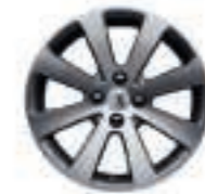
Melbourne 17" Alloy Wheel*** (not chain compatible)