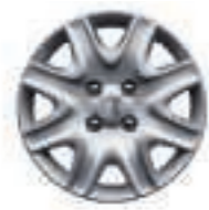
Brisbane 15" wheel trim*