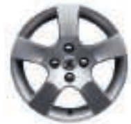
Canberra 16" Alloy Wheel*