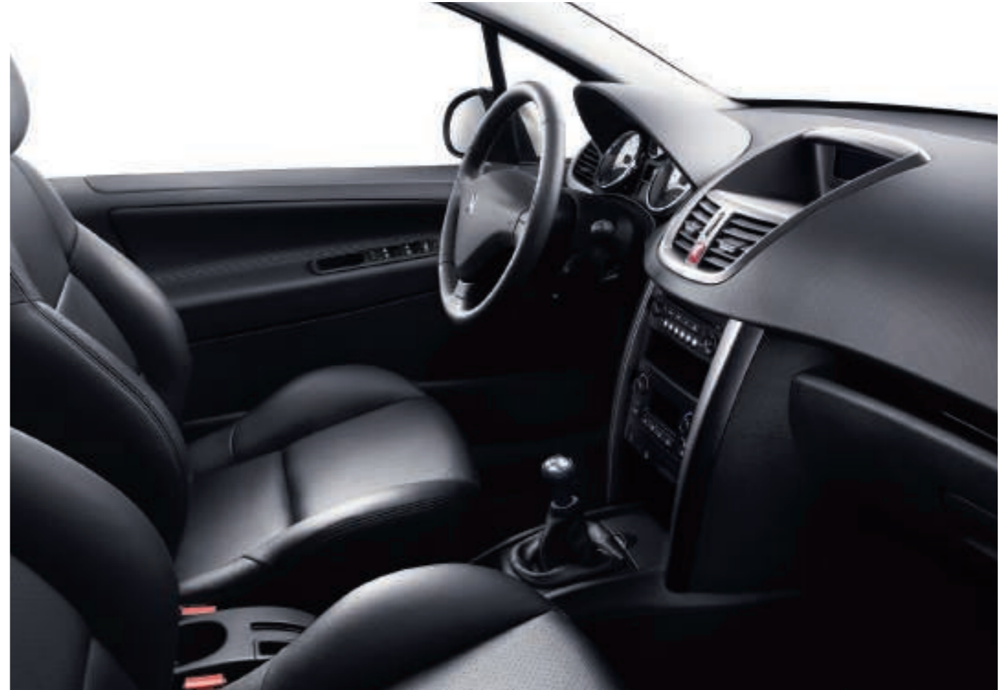
Optional Perforated Mistral Black Leather (1) *