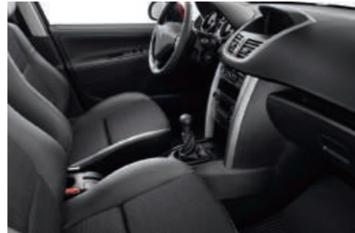
Aspen Cloth – Available on SW Outdoor only