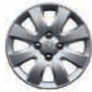
Hobart 15" wheel trim

Please consult Pricing and Specification sheets for full information regarding colour availability.