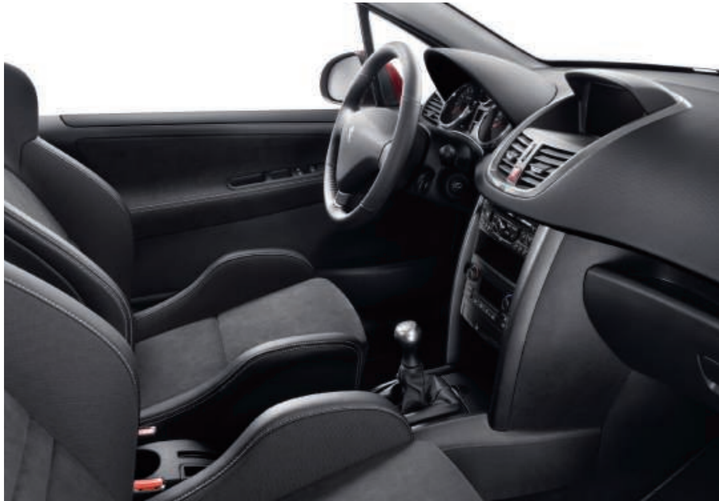
Black Alcantara® – Available on GTI only