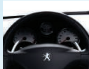
Gear change paddles available with the 2-Tronic gearbox.