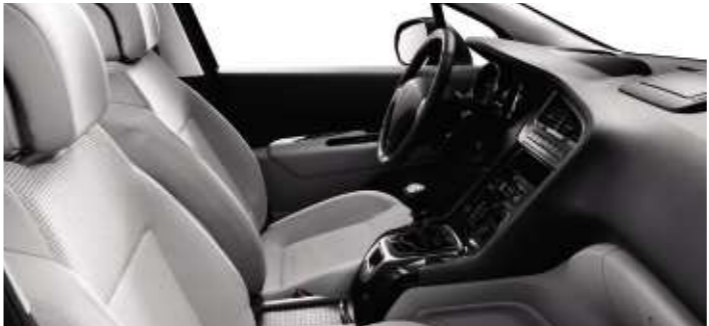
Grey Cloth - Sport & Exclusive