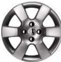
Alloy 16" ERIS