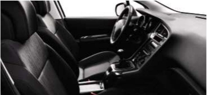
Black Cloth - Active