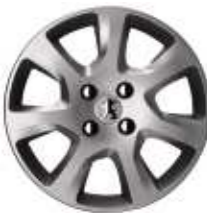
Steel 16" HAUMEA