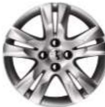
Alloy 17" QUARK