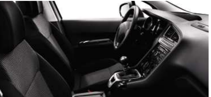
Black Cloth - Sport & Exclusive