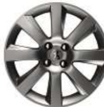
Alloy 18" MAGNETIK